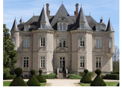
(http://spyhollywood.com/wpcontent/uploads/2016/09/60923_72077112_IMG_09_0000_max_620x414.jpg) This elegant château was built in 1846 and