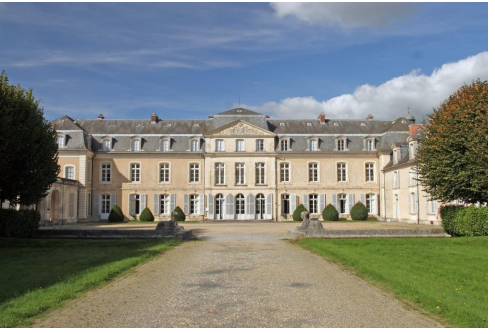
Number of rooms 50